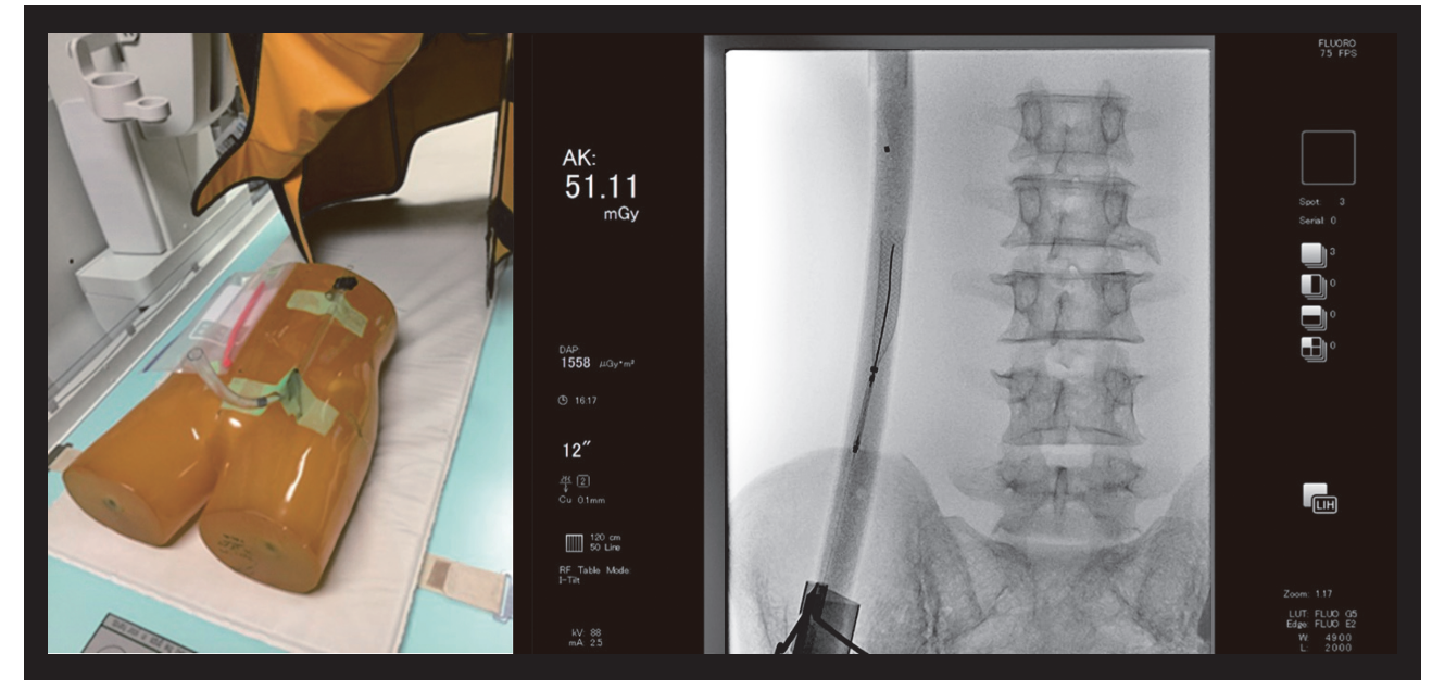
Fig.3 Evaluation of SCORE PRO Advance using a Phantom at our Digestive Disease Center