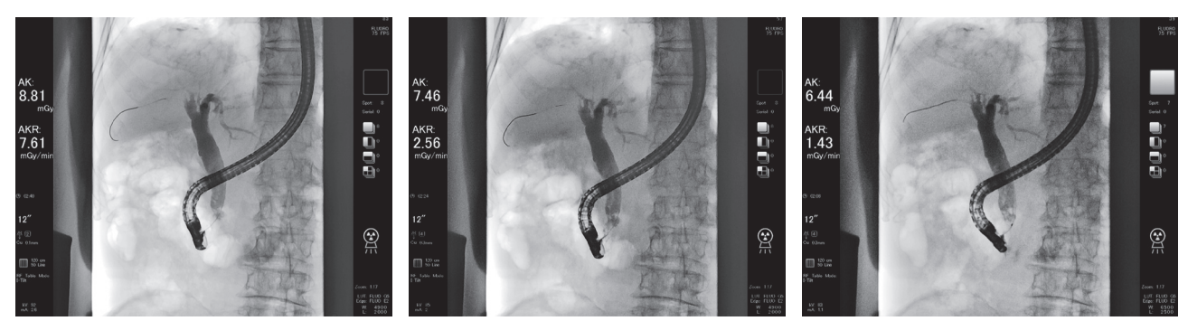
ERCP2: High Quality Mode