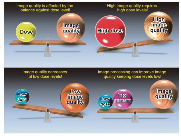
Fig.1 Balance between Fluoroscopic Image Quality and Dose Level

improves as dose level is increased and image quality deteriorates as the dose is decreased ( Fig. 1 ). Advantages of higher image quality include improved visibility, less eye strain, and shorter examination times for the healthcare personnel and safer, more reliable, and more accurate examinations for patients. On the other hand, achieving higher image quality requires applying higher X-ray dose levels, which can cause radiation problems by the e direct or scattered X-rays.