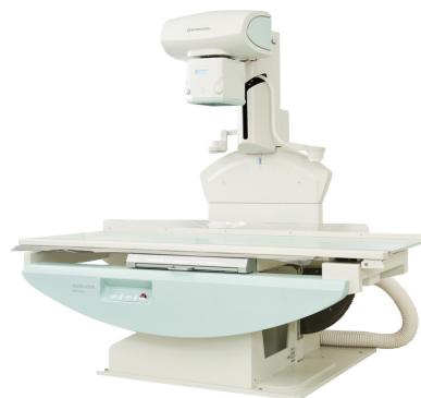
Fig. 1 FLEXAVISION F3 Package

The FLEXAVISION F3 Package exploits the advantages of the portable FPD to support plain radiography and a variety of other examinations, such as lateral radiography on the tabletop and chest radiography 2 in a standing position on the bucky stand.