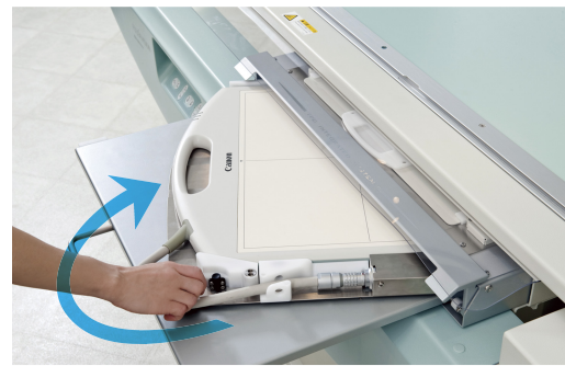
Fig. 2 Rotating the FPD

The 17"×14" FPD can be rotated in its tray as required to switch between portrait and landscape orientations. In the portrait orientation, it can capture images covering the kidneys and bladder during drip infusion pyelography (DIP). In the landscape orientation, it can image the pelvis of a subject with a large body type in a single image.