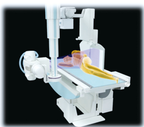
Fig. 5 Decubitus Radiography

When the FPD is mounted in the optional FPD holder, lateral radiography is possible using a second X-ray tube. This is effective for radiography in the decubitus position ( Fig. 5 ).