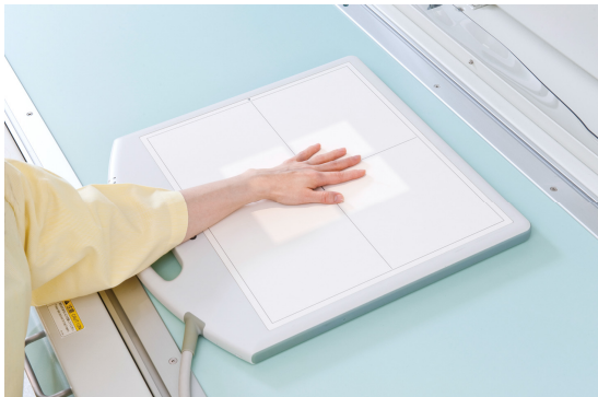
Fig. 4 Tabletop Radiography of Limbs and Hands

The portable FPD can be removed from the R/F table to perform radiography. The limb or hand to be examined is placed in direct contact with the FPD and radiography is performed on the tabletop ( Fig. 4 ).