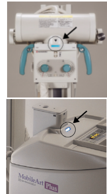
Fig. 3 New collimator and illumination

this installation also provides good resolution even for CR, which is easily influenced by extra-focal radiation (Fig. 3).