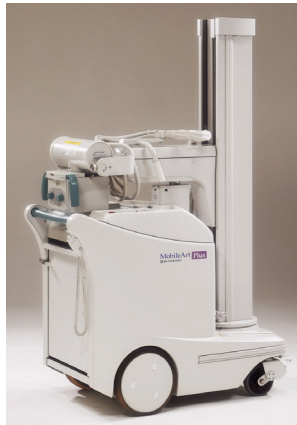
Fig. 1 MobileArt Plus

In response to customer opinions and suggestions about MobileArt, a product that set the standard for electric mobile X-ray systems with easy running and positioning, the MobileArt Plus was developed to increase the level of perfection for MobileArt (Fig. 1).