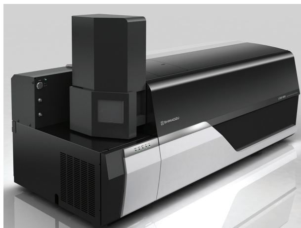
Fig. 1 DPiMS™-8060