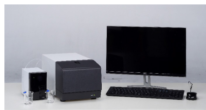
Fig. 1 iSpect™ DIA-10 Dynamic Particle Image Analysis System