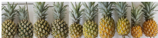
Fig. 1 Pineapple sample from all ripening stages

Indonesian pineapples at 5 different ripening stages were used in this study (Fig. 1). Pineapple fruit was cut into three parts, crown, flesh, and peel. Crown part was analyzed by cutting the leaves into a 1x1 cm size before quenching by liquid nitrogen and freeze dried. Peel part was analyzed by scraping the peel into a 1x1 cm size using stainless-steel knife before quenching and freeze drying. Flesh part was analyzed by cutting the fruit into half then the flesh was diced using stainless-steel knife before quenching and freeze-dried.