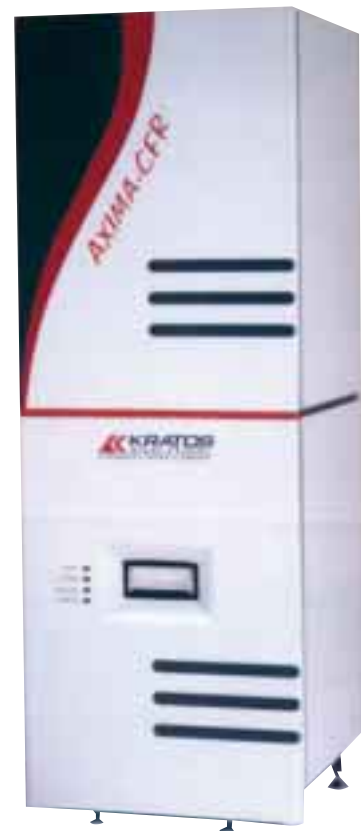
MALDI-TOF Mass Spectrometer - AXIMA-CFR

ization planned for late 2001); Both parties are planning to reinforce the partnership by expanding from protein-related applications into biotechnology as a whole.