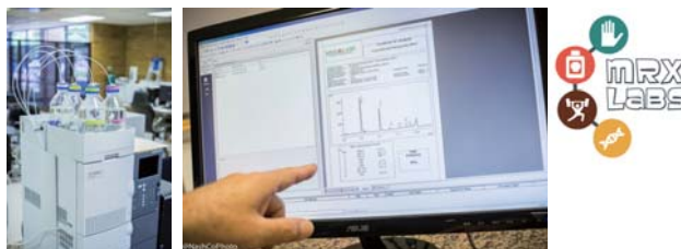
Shimadzu GCMS (top) and LC (bottom) instrumentation at MRX Labs in Portland, Oregon ( www.MRXLabs.com ).