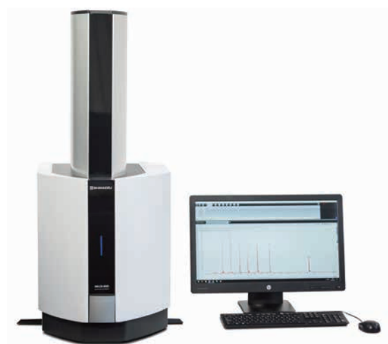
Fig. 1 Benchtop MALDI-TOF MS: MALDI-8020

As polycarbonate (PC) samples, a PC standard sample and a PC oligomer sample extracted from a compact disc were used for analysis (Fig. 2). In the results of both samples, we can see that monoisotopic peaks are detected and that PC monomer units spaced by 254 u are repeated (insets in Fig. 2).