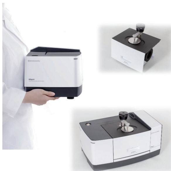
Fig. 1 External Appearance of IRSpirit™ + QATR™-S

The IRSpirit features a small and portable body and the main unit is under A3 size with dimensions of 390 (W) × 250 (D) × 210 (H) mm. Furthermore, its unique design allows access from both sides to enable installation even in narrow spaces. Providing best-in-class SN ratios and resolution, the IRSpirit also features high expandability with the widest sample compartment in its class, which can accommodate both Shimadzu and third party accessories. The instrument can be used for more than just identification testing since functions specific to contaminant analysis, such as contaminant analysis programs and contaminant libraries, are also provided.