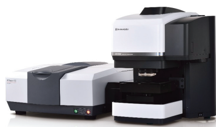
Fig. 1 IRTracer™-100 Fourier Transform Infrared Spectrophotometer (Left) and AIM-9000 Infrared Microscope (Right)

Minute areas of samples can be analyzed in detail by combining the AIM-9000 infrared microscope with the optional mapping program. Fig. 1 shows the instruments used for analysis. The mapping program is capable of both area mapping measurement for analyzing the in-plane distribution of sample components, and line mapping measurement which is effective for analysis at regular intervals along straight lines. In addition to mapping measurement in the standard transmission and reflectance modes, ATR mapping measurement that uses the optional ATR objective mirror and pressure sensor is also available.