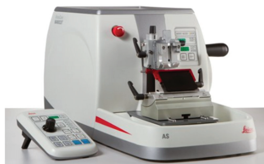
Fig. 2 Leica Biosystems HistoCore NANOCUT R Fully Automatic Rotary Microtome

A Leica Biosystems fully automatic rotary microtome was used to prepare the sample sections. Fig. 2 shows the HistoCore NANOCUT R which is the latest model. The cutting method on the HistoCore NANOCUT R can be switched between automatic and manual modes and the cutting thickness can be set from 0.25 to 300 \mu\text{m} . In this example, 3 \mu\text{m} thick sections were created through vitreous ice-embedding using the EF-13 electronic sample freezing device.