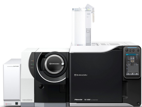
Fig. 1 Appearance of Py-GC/MS System