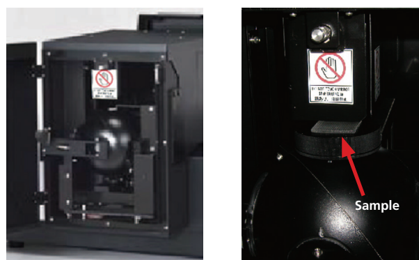
Fig. 3 Inside the ISR-1503 (left) and with Sample Installed (right)