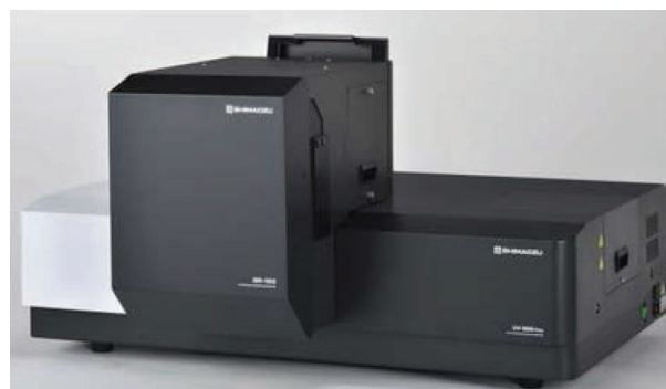
Fig. 2 UV-3600 Plus with ISR-1503 Attached

We performed measurements of solar battery glass under the analytical conditions shown in Table 1, using the UV-3600 Plus and ISR-1503 (150 mm diameter integrating sphere with three detectors). Fig. 2 shows the UV-3600 Plus with ISR-1503 attached, and Fig. 3 shows the inside of the ISR-1503 on the left, and the sample installed on the right.