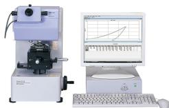
> DUH-211/211S Dynamic Ultra Micro Hardness Tester

Some products may be updated to newer models.