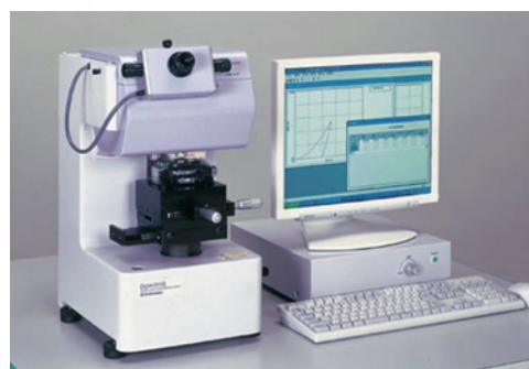
Fig. 1 Overview of Shimadzu DUH-211S Dynamic Ultra Micro Hardness Tester

The testing machine used in this test is the Shimadzu DUH-211 Dynamic Ultra Micro Hardness Tester (shown in Fig. 1), and three micro Vickers hardness standard blocks having different nominal hardness values listed in Table 1 (HVM = 100, 200, 400) were used as the test subjects.