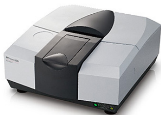
Fig. 1 IRTracer™-100

The Shimadzu IRTracer™-100 Fourier transform infrared spectrophotometer (FTIR) shown in Fig.1 was used. Measurements were carried out by the 10-bounce attenuated total reflectance (ATR) method using a horizontal ATR accessory (HATR). Table 1 shows the measurement conditions. The maple syrup samples were diluted to 10 % w/w with water and dripped on the ATR prism (ZnSe) for measurement.