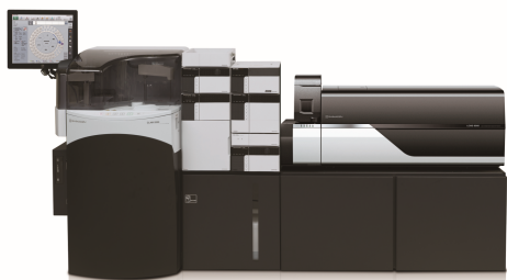
Fig. 1 Fully Automated Sample Preparation LC/MS/MS System (CLAM™+LC/MS/MS)