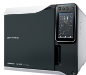
➤ Nexis™ GC-2030 Gas Chromatograph

Some products may be updated to newer models.