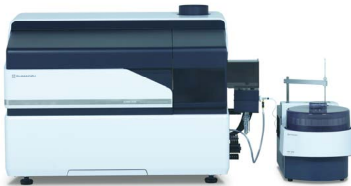
Figure 1. ICPMS-2030 Inductively coupled plasma mass spectrometer with AS-10.

A Shimadzu ICPMS-2030 coupled with auto sampler AS-10 (Figure 1) was used for analysis of measuring elements in tea and coffee matrix. The detailed instrument configurations and operating parameters are summarized in Table 4.