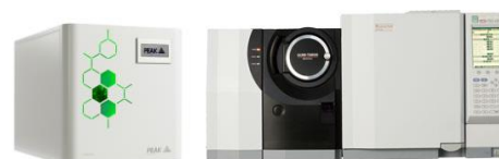
Fig. 1: Precision H 2 Trace (PEAK Scientific Corp.) Hydrogen Gas Generator and GCMS-QP2020