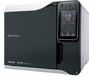
➤ Nexis™ GC-2030 Gas Chromatograph

HPLC Column Solutions - Reversed phase and Normal phase - Shim-pack