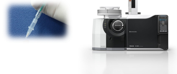
Fig. 1 Presh (left) and GCMS-TQ™8040 NX (right)