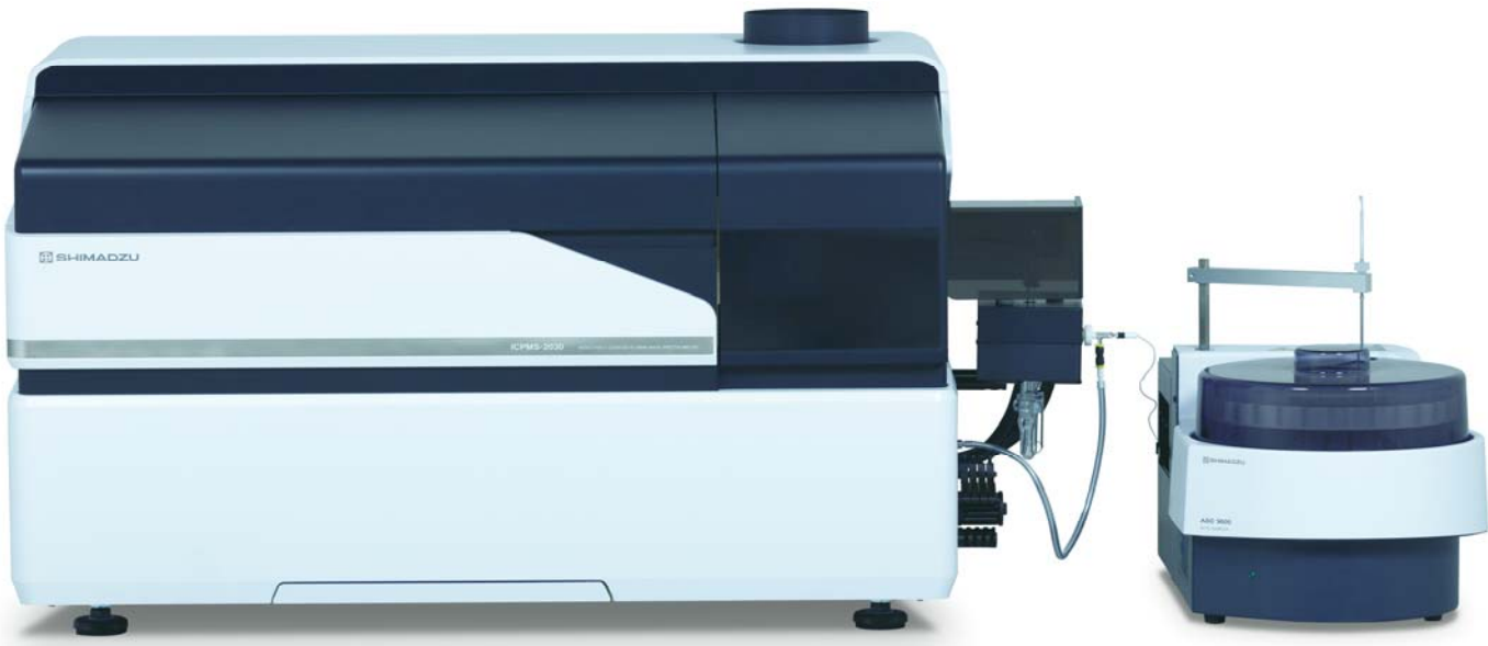
Figure 1. Shimadzu ICPMS-2030 with Autosampler AS-10