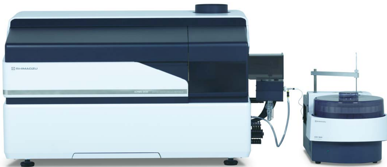
Figure 1. Shimadzu ICPMS-2030 with Autosampler AS-10