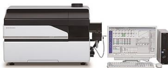
Figure 1: ICPMS-2030

All analyses was carried out on Shimadzu ICPMS-2030 coupled with mini torch and AS-10 autosampler. The detailed instrument configuration and operation parameters were summarized in Table 1. Helium collision cell provides an effective way to remove possible polyatomic spectral interferences. The cell gas mode was applied for all the elements except for Li and Sb as shown in Table 2. The instrument was tuned and optimized using a mixed tuning solution and warmed up to 30 minutes before measurement.