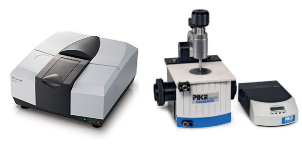
Fig. 2 IRTracer<sup>™</sup>-100

The GaldiATR is an ATR accessory that provides high energy throughput, high applied pressure, a wide wavenumber range, and an optional crystal plate compatible with high temperatures. Two heating plates with maximum temperatures of 210 °C and 300 °C are available for the GaldiATR; the 300 °C plate was used in this experiment. A programmable temperature controller that can be controlled from a computer is also available for the GaldiATR.