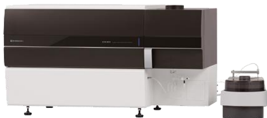
Fig. 1 ICPE™-9820

Among various techniques for elemental composition analysis, ICP-OES (Figure 1), is one of the most preferred analytical methods due to its high sensitivity, low detection limits, multi-elemental capability and high matrix tolerance. In this application, an ICP-OES method was developed and optimized following the EN15621 [3] guidelines for methods of sampling and analysis for animal feeding stuffs. The ICP method was evaluated and applied to analyse the essential and toxic elemental composition of different commercial animal feed samples.