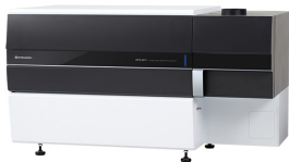
> ICPE-9800 Series Multitype ICP Emission Spectrometers

Some products may be updated to newer models.