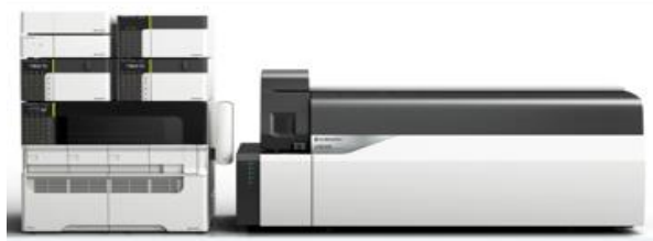
Fig. 1 Shimadzu LCMS TM -8045

All samples were analysed as per conditions shown in Table 2 and 3 for LC-MS/MS and GC-MS/MS, respectively.