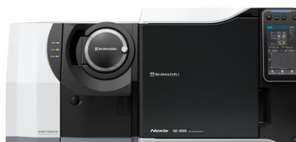
Fig. 2 Shimadzu GCMS-TQ TM 8040 NX