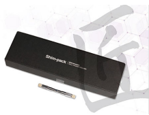
> Shim-pack Arata LC Columns HPLC Column