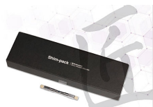
➤ Shim-pack Arata LC Columns HPLC Column

Some products may be updated to newer models.