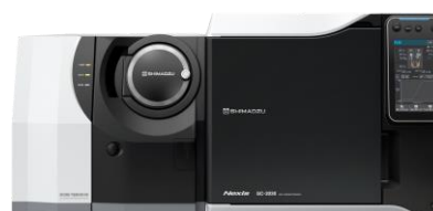
Fig. 2 Shimadzu GCMS-TQ TM 8040 NX