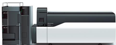
Fig. 1 Shimadzu LCMS TM -8050

All samples were analysed as per conditions shown in Table 2 and 3 for LC-MS/MS and GC-MS/MS, respectively.