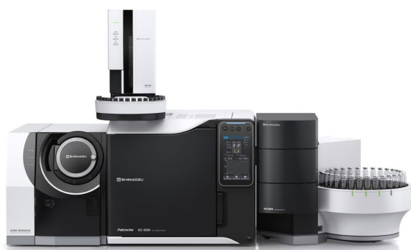
Fig. 1 GCMS-QP2020 NX + HS-20 NX + AOC-30i

E-cigarettes have become increasingly popular in recent years. E-cigarettes are used by heating the flavored e-liquid instead of using tobacco leaves, and enjoying the flavor. The vaporization ratio of aroma compounds changes depending on the temperature, since the vapor pressure of each aroma compound is different. Therefore, the flavor of e-liquid is expected to change depending on the temperature. GC/MS analysis is useful for objectively evaluating the correlation between flavors and aroma compounds. In this report, aroma compounds of e-liquid with a simple pretreatment were analyzed under an environment close to the actual use conditions, by using the Smart Aroma Database and the HS-20 NX headspace sampler.