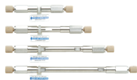
➤ Shim-pack XR Series HPLC Column

Some products may be updated to newer models.