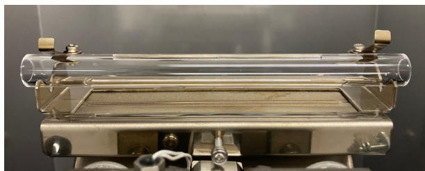
Fig. 1 Atom Booster

The atom booster is a quartz tube with an overall length of about 15 cm that has vertical slits at the top and bottom. (The lower slit is 100 mm long and the upper slit is 80 mm long.) The upper slit is shorter than the lower slit, so atoms stay longer in the flame. That increases the density of atomized elements, leading to improved absorbance. It is especially effective for elements that atomize at relatively low temperatures (Cd, Pb, Cu, etc.).