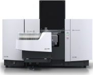
> AA-7800 Atomic Absorption Spectrophotometer