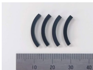
Fig. 3 Sample appearance

Moldings made of Sn containing polyvinyl chloride (PVC) resin were analyzed. Fig. 3 shows a photograph of the of the samples. When measuring, four molded articles were measured side by side.