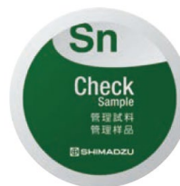
Fig. 2 Check Sample of Sn Screening Analysis Kit

For equipment management, the Sn containing polyethylene control sample is included in the analysis kit. Fig. 2 shows the appearance of the control sample.