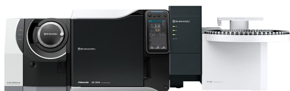
Fig. 1 TD-30R+GCMS-QP™2020 NX

The reader may also refer to Application News 01-00366-EN in which nitrogen was used as the carrier gas in place of helium in the VOC measurement.