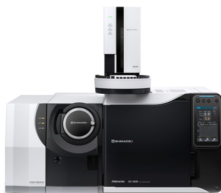
Fig. 1 AOC-30i + GCMS-TQ™8040 NX

In Application News 01-00526 , the article “Quantitative Analysis of 57 Fragrance Allergens in Cosmetics Using Twin Line MS System”, introduced an example of analysis for fragrance allergens in cosmetics using a single quadrupole GCMS. However, in complex matrix samples like cosmetics, accurate quantitation can be hindered by the interference of impurities. In such cases, performing MRM analysis with a triple quadrupole GCMS is expected to improve measurement accuracy. This Application News presents the results of investigation on how to further enhance sensitivity, accuracy, and analytical stability using a triple quadrupole GCMS.