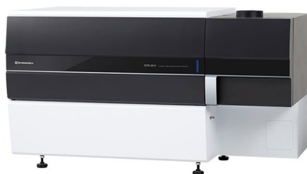
Fig. 1 ICPE-9820 simultaneous ICP atomic emission spectrometer

In this application news, Shimadzu ICPE-9820 (Fig. 1), a simultaneous inductively coupled plasma (ICP) atomic emission spectrophotometer was used to conduct simultaneous analysis of elements in a black mass sample. With its dual plasma axial/radial axis viewing, analysis of elements present from trace to high level concentrations can be performed.