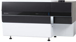
➤ ICPE-9800 Series Multitype ICP Emission Spectrometers