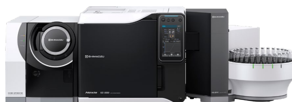
Figure 1: GCMS-QP™2020 NX and HS-20 NX Headspace Autosampler

For the preparation of calibration standard solutions, 1,4-dioxane was diluted with Mili-Q water to final concentrations of 1, 2, 5, 10, 20, 50 and 100 µg/L.