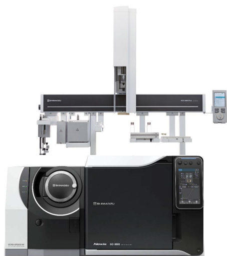
Fig. 1 AOC™-6000 Plus + GCMS-QP2020 NX

For the preparation of calibration standard stock solutions, five mixed standard solutions were diluted with acetone to final concentrations of 0.1, 0.2, 0.5, 1, 2, 5 and 10 µg/mL, and the internal standard was diluted at a concentration of 1 µg/mL. To confirm the linearity of each component, 20 µL of each of the prepared mixed standard solutions and internal standard solutions put into a headspace vial containing 19.96 mL of water and then sealed them.