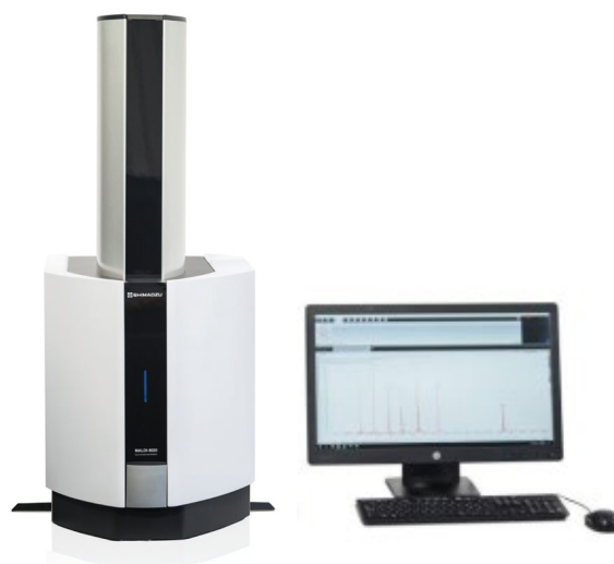
Fig. 1 MALDI-8020 benchtop mass spectrometer

The prepare sample is analyzed with the MALDI-8020 –System shown in Fig. 1. Table 1 shows the measurement conditions.