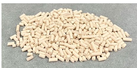
Fig. 1 Zeolite (Molecular Sieve)

Zeolites (Fig. 1) have a microporous structure with numerous pores that can adsorb molecules smaller than the diameter of those pores. This property allows zeolites to be used as a molecular sieve that separates molecules based on their size. For example, zeolites with pore sizes larger than the diameter of \text{CO}_2 molecules can be used as a \text{CO}_2 sorbent. Also, fine-tuning pore sizes between the diameter of \text{CO}_2 molecules (approximately 0.33 nm) and \text{CH}_4 molecules (approximately 0.38 nm) allows zeolites to be used as separation membranes that separate these two molecules.