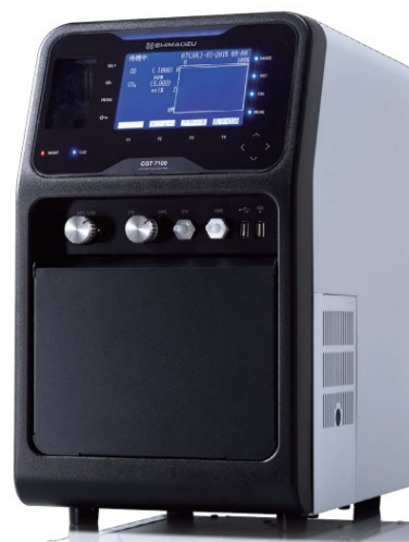
Fig. 4 CGT-7100 Transportable Gas Analyzer

The transportability and simplicity of the CGT-7100 make it a flexible tool and an ideal gas analyzer for a variety of testing and research applications. From applications in CO 2 capture and storage covered in this article to others related to carbon neutrality, such as methanation technology and new energy, Shimadzu's transportable gas analyzer offers an excellent tool for a variety of situations that require gas level measurement and monitoring.