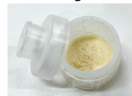
Fig. 1 Image of Sample

The samples were introduced into sample containers lined with polypropylene film (thickness: 5 μm), and simple compression was applied. Fig. 1 shows an image of a sample.