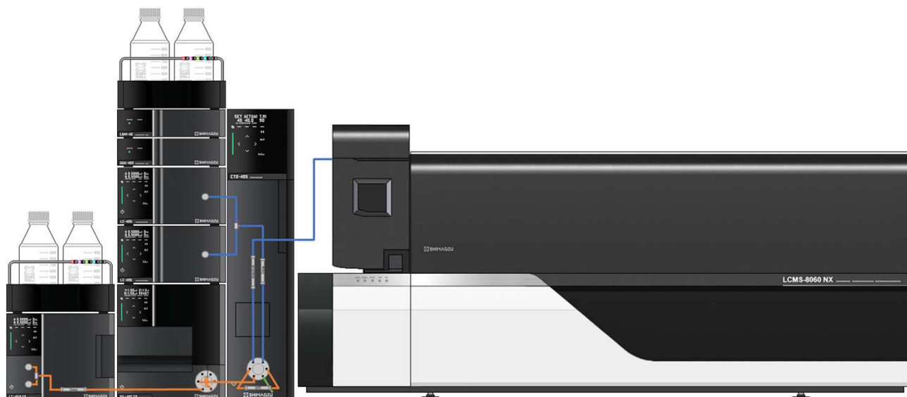
Figure 3 Scheme of the Nexera on-line SPE LCMS-8060NX system