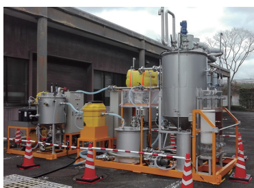
Fig. 2 Transportable Methane Fermentation Pilot Plant

IRI Shizuoka Pref. is developing a high-efficient and low-cost methane fermentation plant for small-scale food processing companies. In early 2017, a transportable methane fermentation pilot plant with a 1,000 L fermentation tank shown in Fig.2 was developed by industry-academia-government collaboration team. Starting from 2017, the team sets up the pilot plant at various kinds of food processing factories to verify fermentation performance and cost efficiency of each food waste. The test results will be disclosed as model case to encourage other food processing companies to adopt methane fermentation plant in the prefectural area.