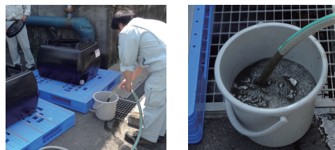
Fig. 4 Methane Fermentation Residue (Digestion effluent after methane fermentation)