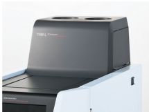
> TNM-L Total Nitrogen Unit for TOC-L Series