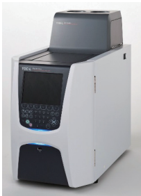
Fig. 6 TOC-L Total Organic Carbon Analyzer + TNM-L Total Nitrogen Unit

Table 2 and Fig. 7 show the analysis results of the raw material and digestion effluent. The decrease in TOC concentration indicates that more than 90 percent of organic materials were decomposed through fermentation. Also, the preservation of TN concentration indicates that nitrogen was maintained through fermentation and the effluents can be used as fertilizer.