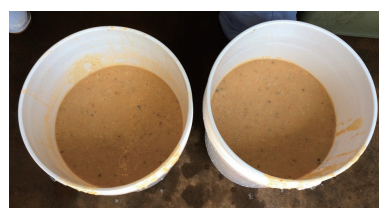
Fig. 3 Food Waste Slurry (Raw material for methane fermentation)

Fig.3 shows food waste slurry which is raw material for methane fermentation. Fig. 4 shows methane fermentation residue which is digestion effluent after fermentation. In order to achieve stable methane fermentation, the ratio of carbon and nitrogen (C/N ratio) in the raw material must be within a certain range. IRI Shizuoka Pref. measures TOC and TN of the raw materials to adjust the C/N ratio and to calculate the gas generation efficiency. TOC and TN of the digestion effluents are also measured to calculate the decomposition rate and to evaluate fertilizer components.