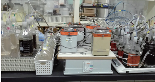
Fig. 5 Laboratory-scale Methane Fermentation Test System

In addition to the transportable methane fermentation pilot plant, IRI Shizuoka Pref. has a laboratory-scale methane fermentation test system shown in Fig. 5. Food wastes from food processing companies are tested with the laboratory-scale system and examined whether they can proceed to the pilot plant test or not.