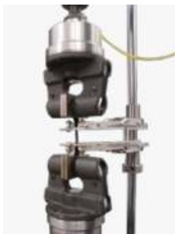
Fig. 1: Test Status