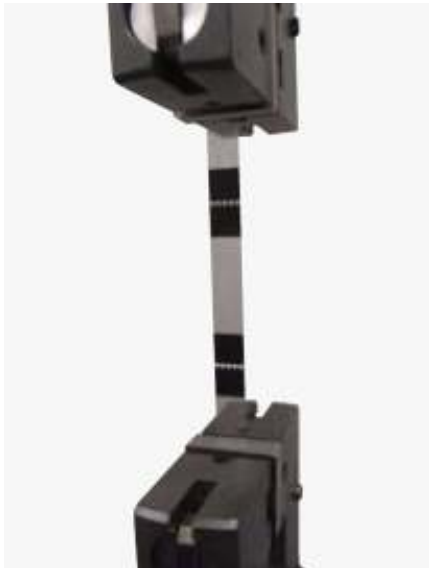
Fig. 1: Test Status