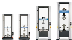
> AUTOGRAPH AGS-X2 Series Precision Universal Testing Machines