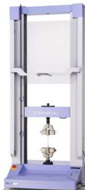
AGS-X Table-Top Precision Universal Tester