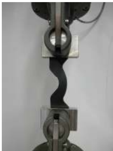
Fig. 1: Test Status