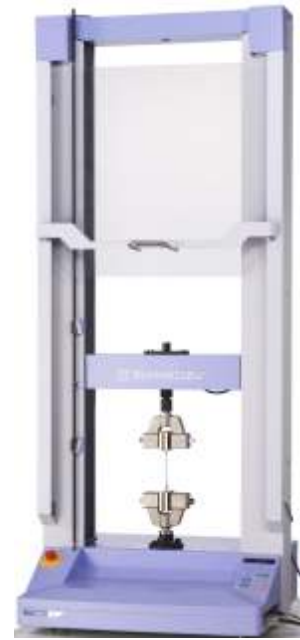
AGS-X Table-Top Precision Universal Tester