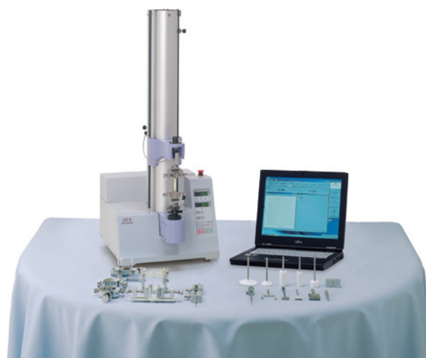
Fig. 1 Appearance of Texture Analyzer