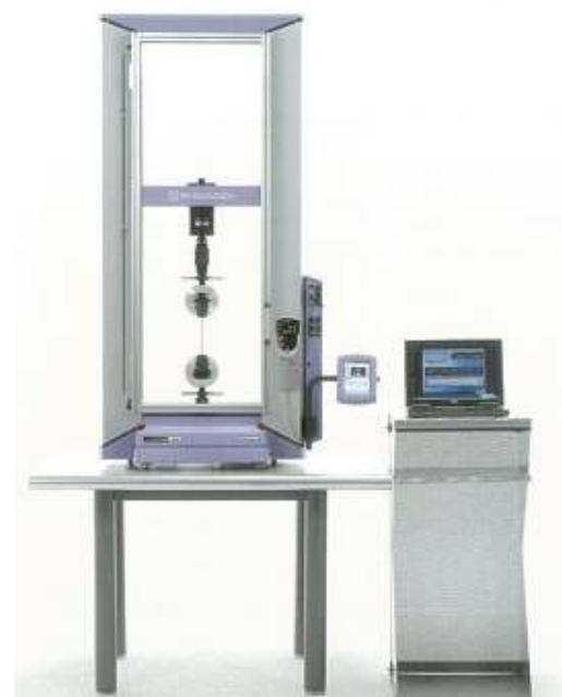
AG-Xplus Table-Top Precision Universal Tester