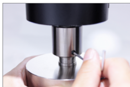
Connect the joint and plate, and fix by screw

Once the upper compression plate and lower support plate are installed on the universal tester, the specimen is centered on the lower support plate. Compression testing is undertaken using the desired experimental parameters.