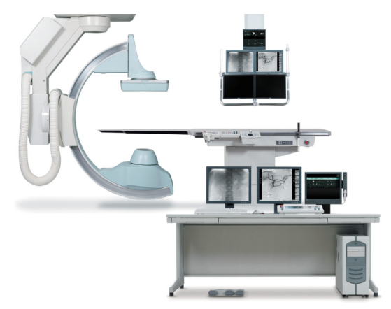
Fig. 1 17×17-inch BRANSIST safire VC17 (Ceiling-Mounted Type)

The VC17 was the first angiography system in the world to be equipped with a 17 × 17-inch FPD, and the very first model was introduced at our hospital in August last year. I would like to describe our experience of using it.